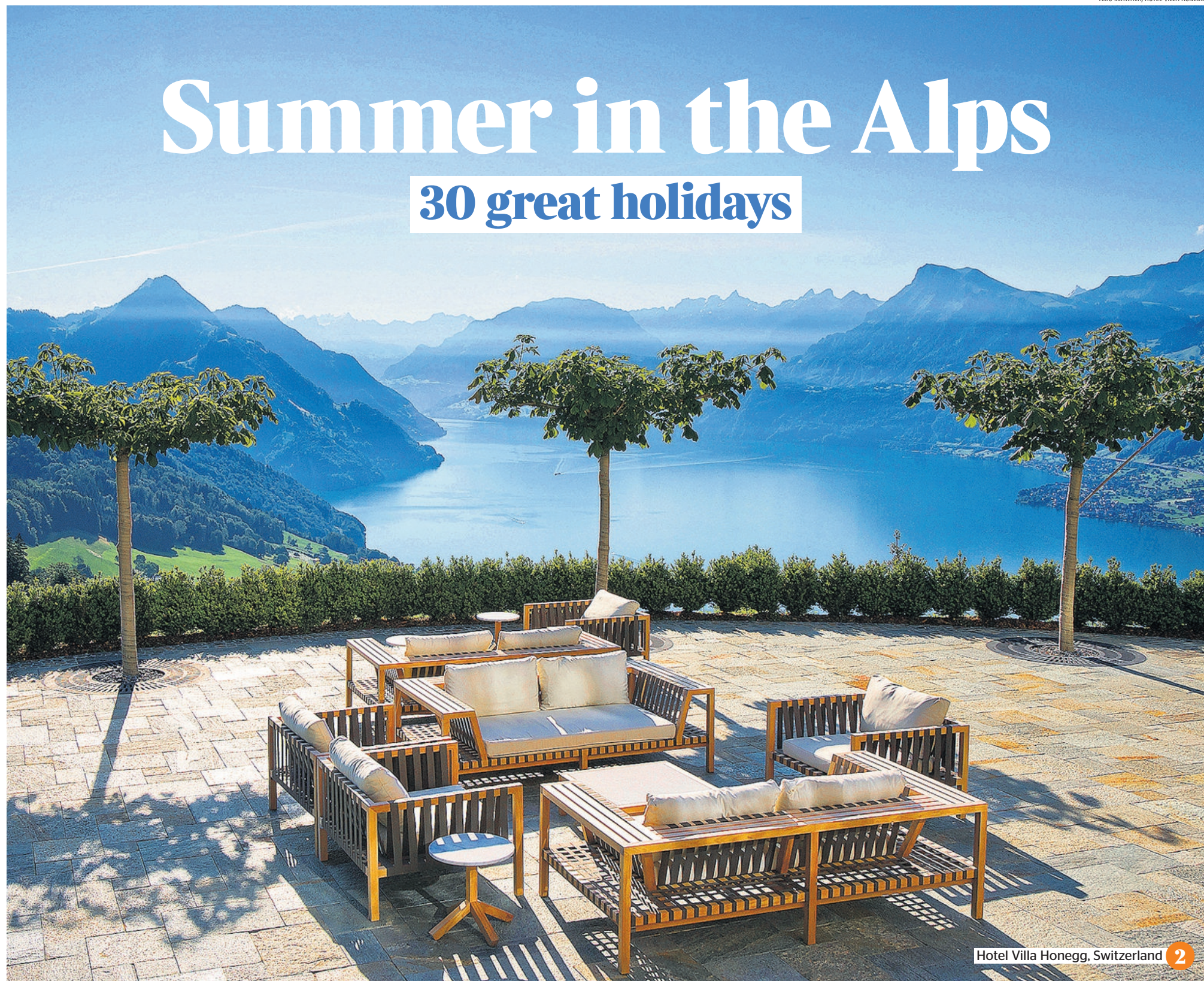
Hotel Villa Honegg, Switzerland 2

Soak up the views from a Swiss spa, stay in a chic Italian chalet, or hike through mountain meadows in Austria. Gemma Bowes has the pick of the trips